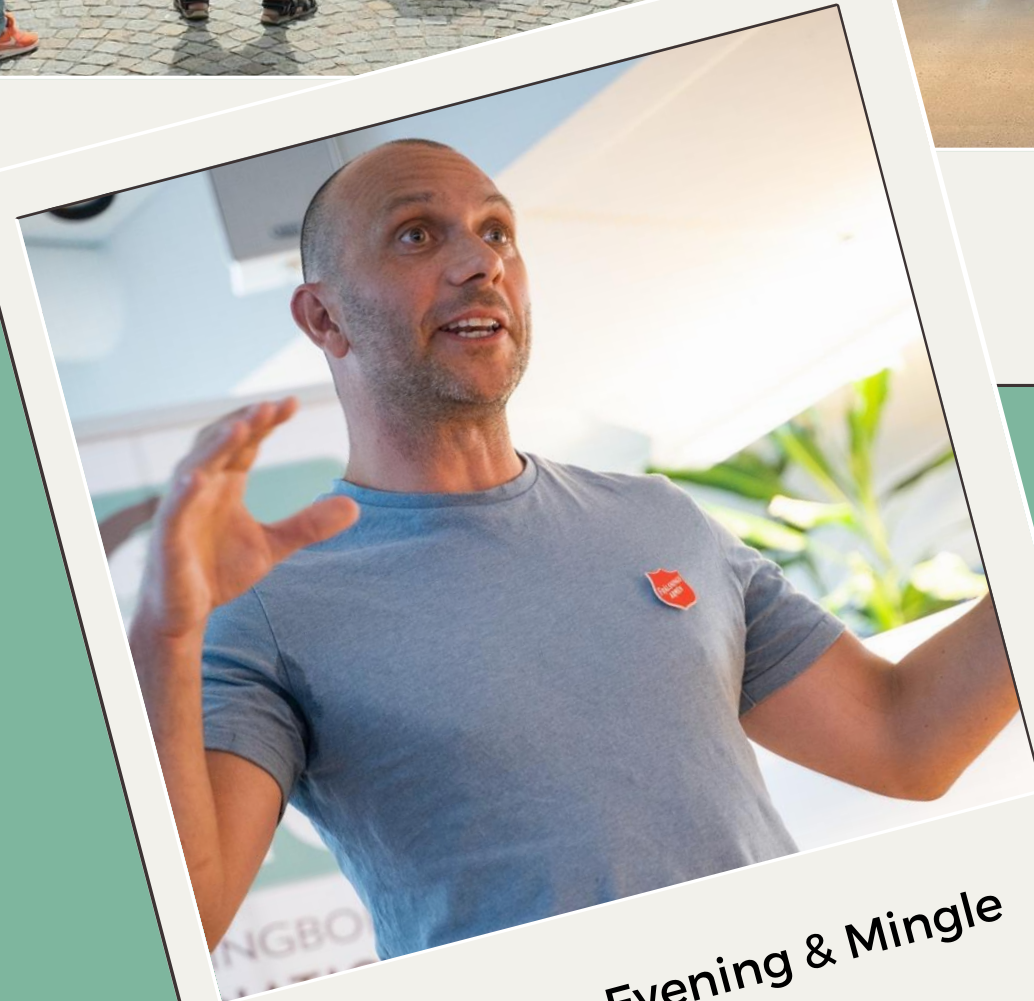
Inspiration Evening & Mingle