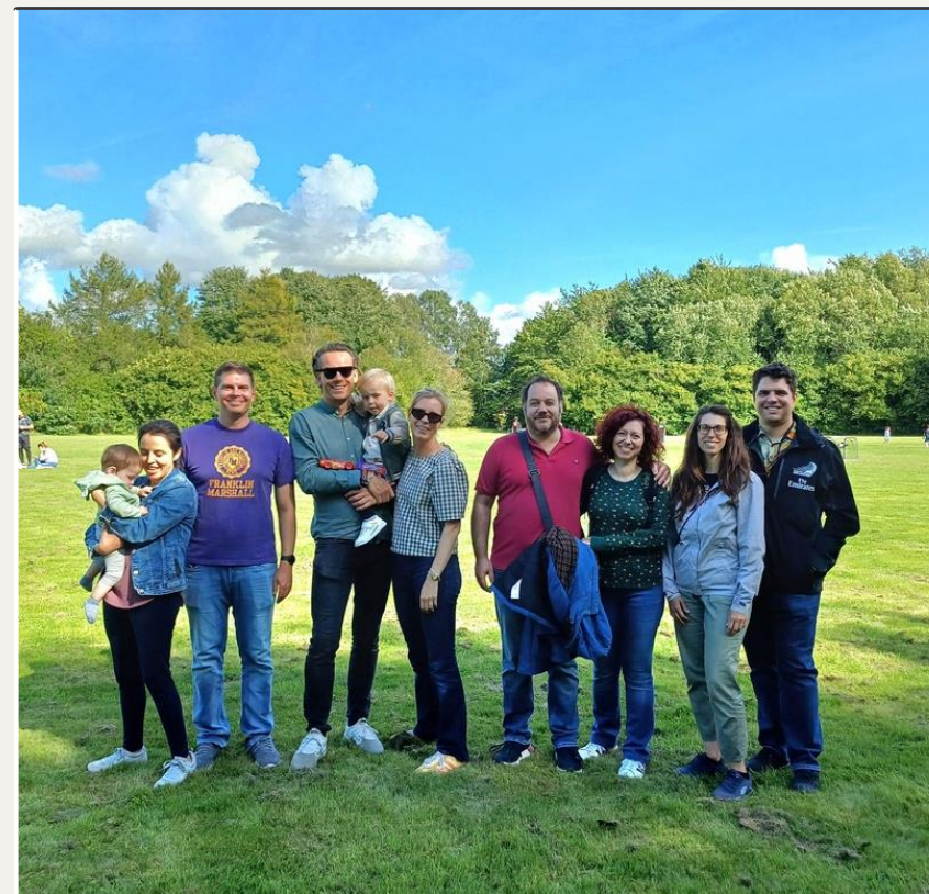
Summer Picnic & Kubb